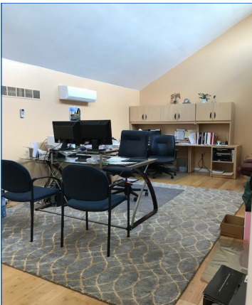
Private loft office available