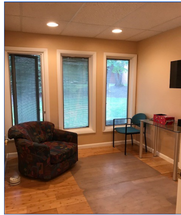
One of the Available Offices