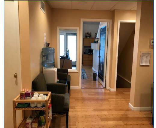
Additional waiting room or office space