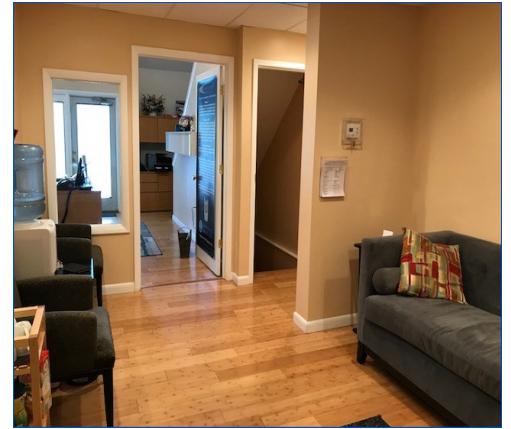
Same space as above—different angle