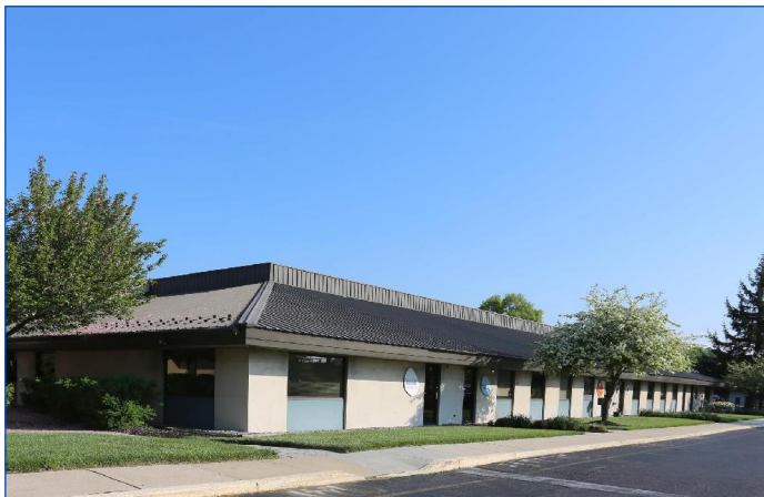
15 E Uwchlan Avenue—300 Building