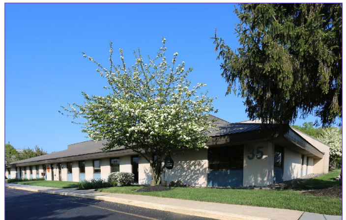
35 E Uwchlan Avenue—400 Building